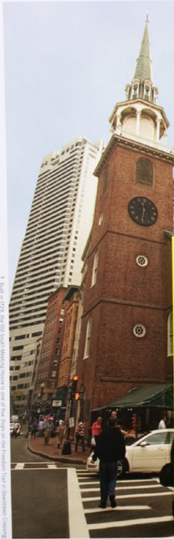
1 Built in 1729, the Old South Meeting House is one of five stops on the Freedom Trail in Downtown Crossing.